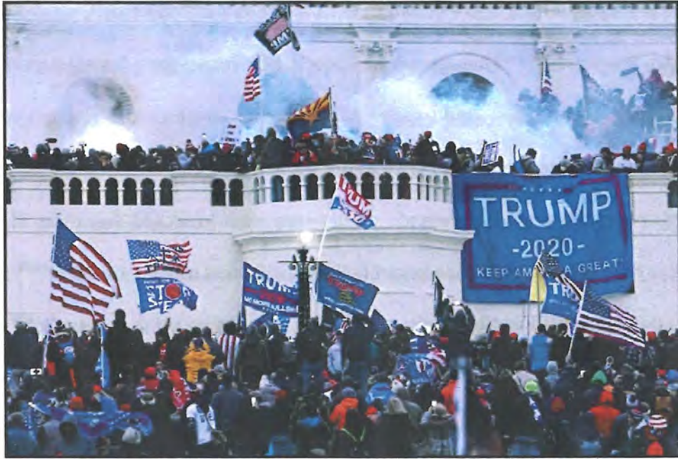
Photograph of the Capitol on January 6, 2021 112