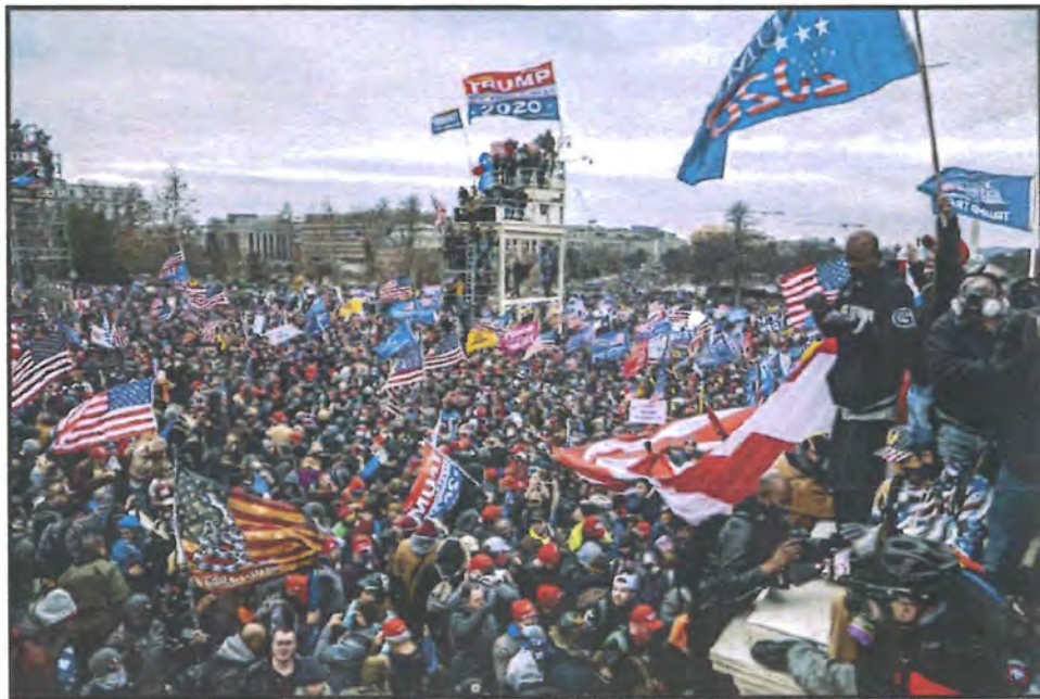
Photograph of the Capitol on January 6, 2021 113