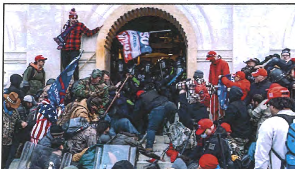
Photograph of the Capitol on January 6, 2021 115