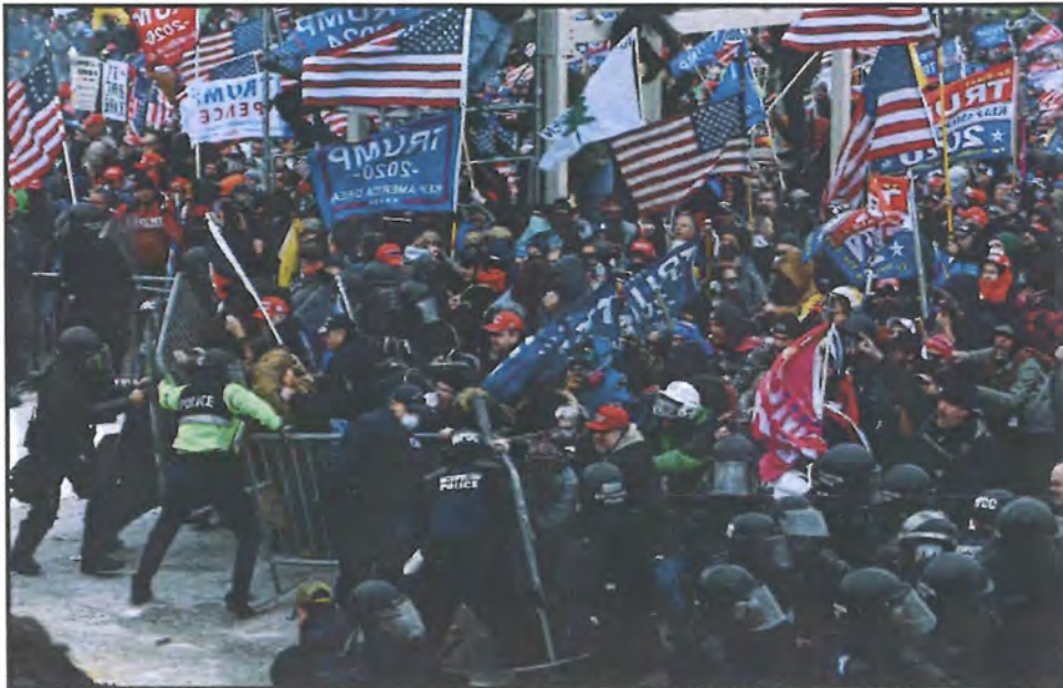
Photograph of the Capitol on January 6, 2021 117