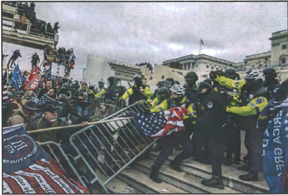
Photograph of the Capitol on January 6, 2021 116