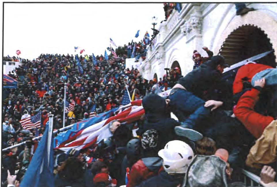
Photograph of the Capitol on January 6, 2021 114